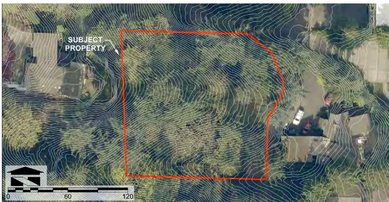
Figure 2: Site Topography